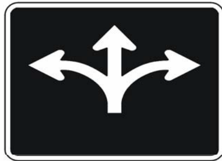
RB-61S-C 600mm x 450mm