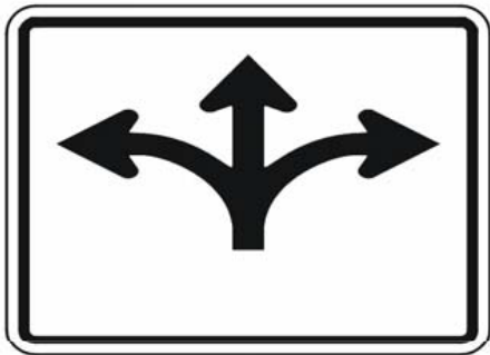
RB-61S-A 600mm x 450mm