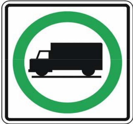
RB-61 600mm x 600mm